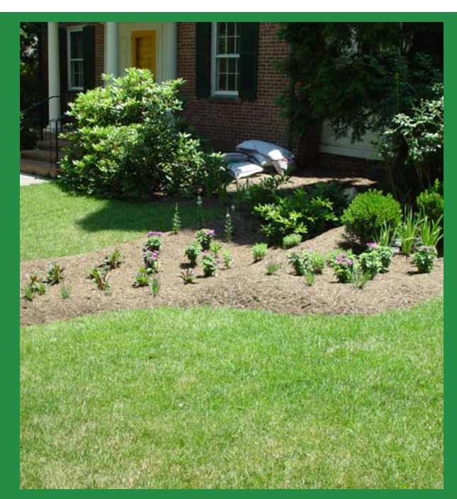
Newly-planted rain garden