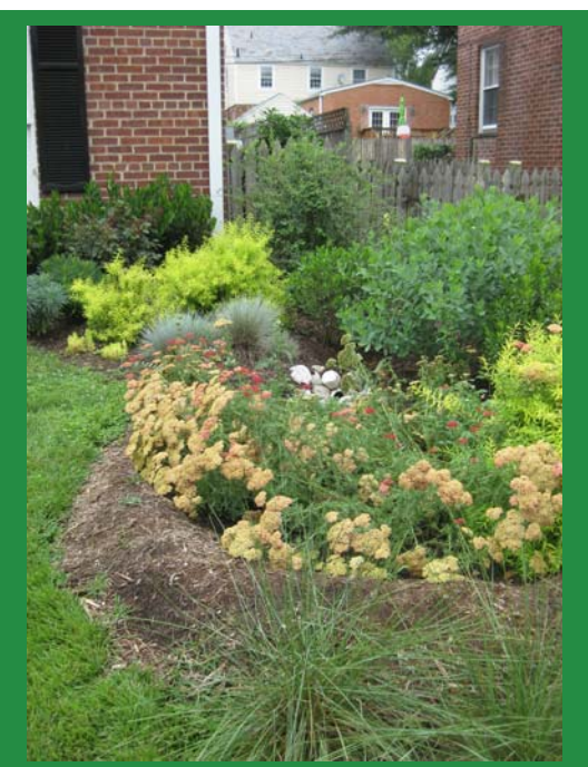
Mature rain garden