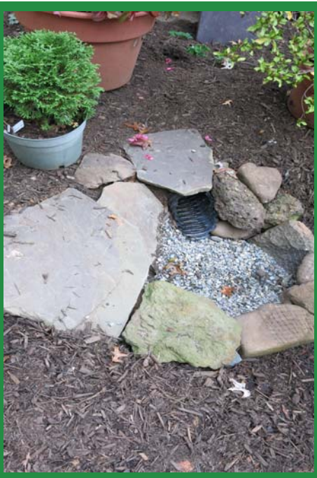
Downspout inlet to rain garden