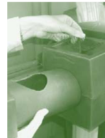
Inspect the filters

Spring – Switch to "Collect" for April showers