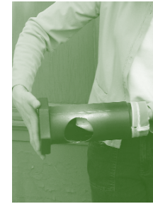
Clean and re-insert the filter cylinder