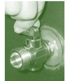
Close the drain valve