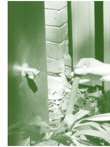
Remove the hose connection

Winter – Switch to "By-pass" for winter flows