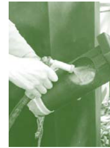
Invert the RiverSafe filter sock; clean with a hose