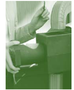
Reinsert the filter cylinder

Winter – Switch to "By-pass" for winter flows