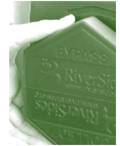
Turn the valve to "By-pass"

Spring – Switch to "Collect" for April showers