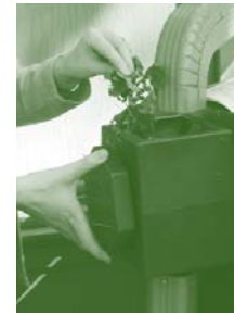
Remove debris from the mesh screen