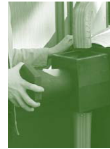
Pull out the filter cylinder