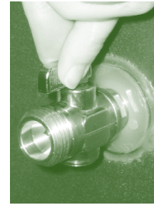
Open the drain valve