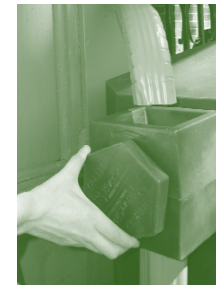
Turn the valve to "Collect"