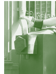
Check the downspout connections