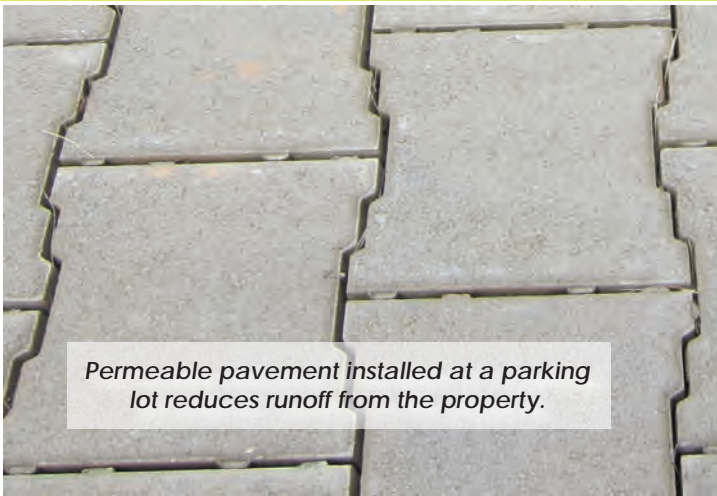
Permeable pavement installed at a parking lot reduces runoff from the property.

DOEE certifies SRCs and approves RiverSmart Rewards discounts for 3 year periods.