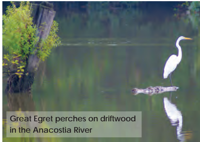
Great Egret perches on driftwood in the Anacostia River

DOEE is hard at work to restore full use of the Anacostia and Potomac Rivers and Rock Creek to District residents, visitors, and businesses. The SRC trading and RiverSmart Rewards programs are important parts of that effort.