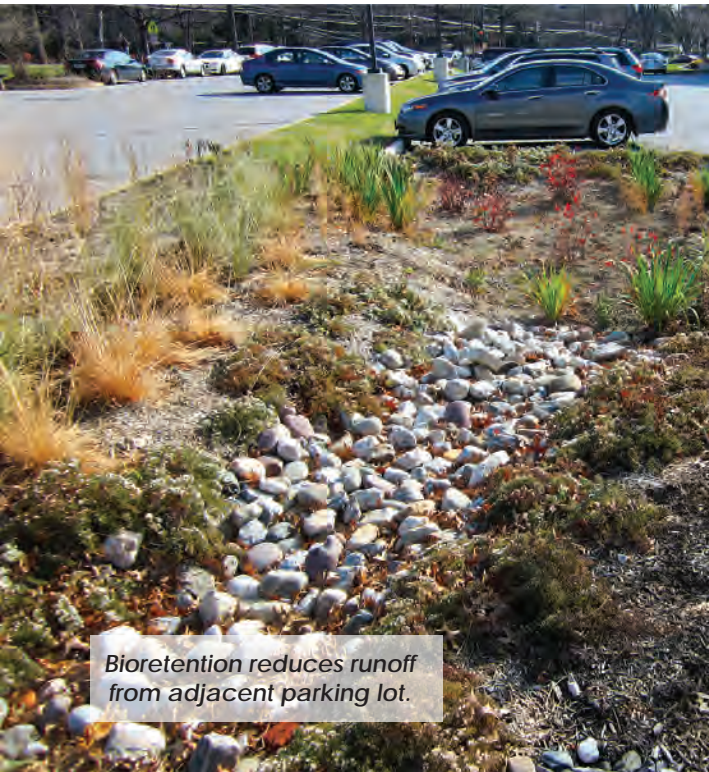
Bioretention reduces runoff from adjacent parking lot.

DOEE's Stormwater Management Guidebook includes design standards and other technical specifications for GI, referred to as stormwater retention Best Management Practices. See doee.dc.gov/swregs