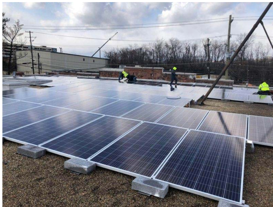
AYT Auto Services rooftop solar installation

Contact DOEE's Solar for All hotline at (202) 299-5271 or solarforall@dc.gov