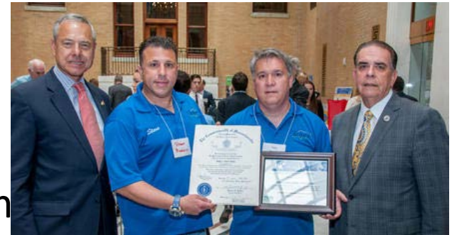
Toxics Use Reduction Institute, Mike's Auto Body was recognized as a Champion of Toxics Use Reduction