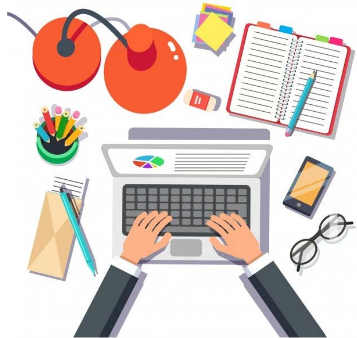
Final report for grant period