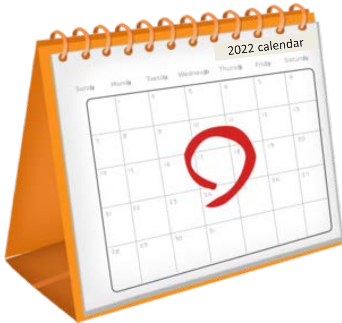
Quarterly progress reports