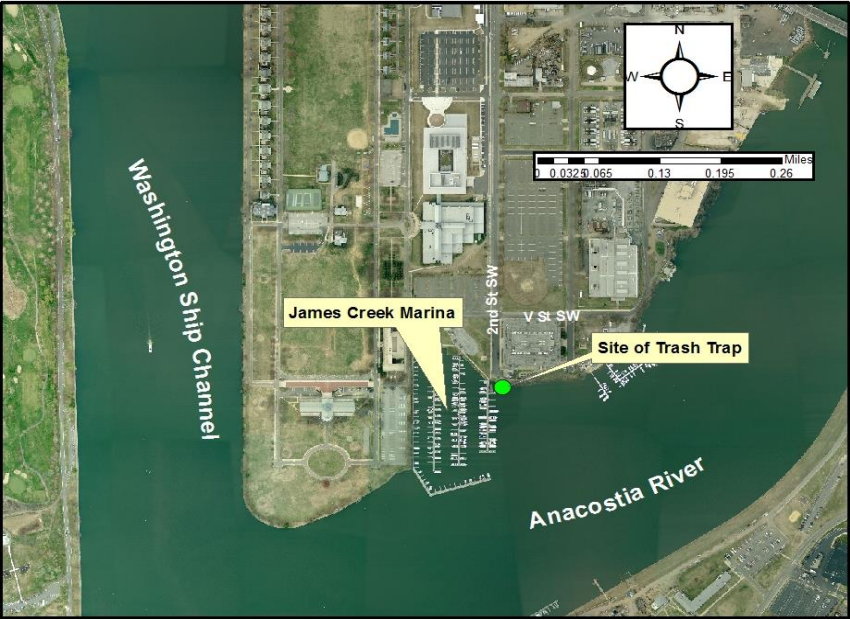
Location of James Creek Marina Bandalong Trash Trap