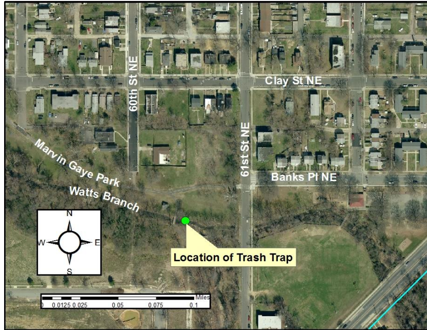
Location of Marvin Gaye Park Bandalong Trash Trap