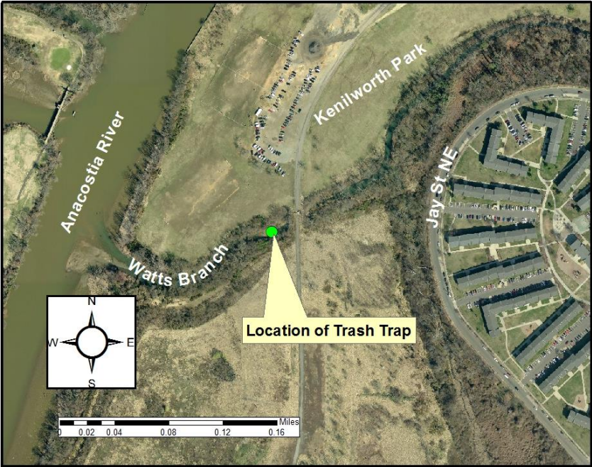
Location of Kenilworth Bandalong Trash Trap