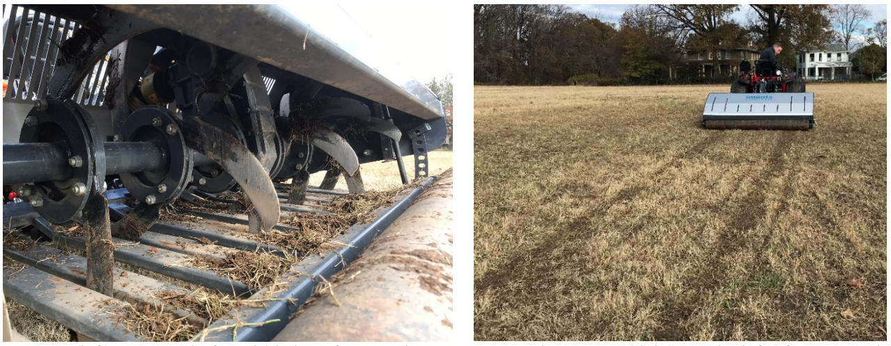
Photo 1 (left): Rotary shaft and blades of rotary de-compactor and Photo 2 (right): tracks left after rotary de-compaction