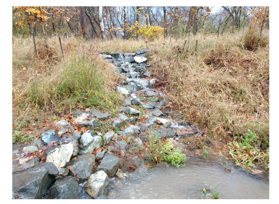
D. Rock Cascade