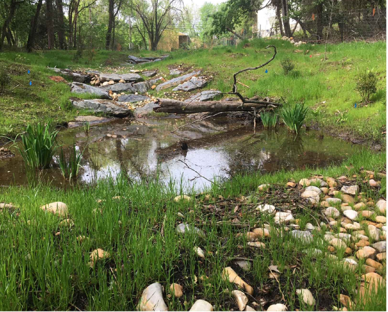
B. Rock Cascade and Pool