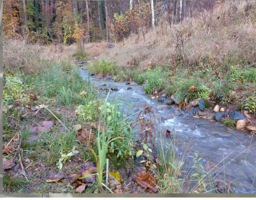
C. Wetland and Stream Complex