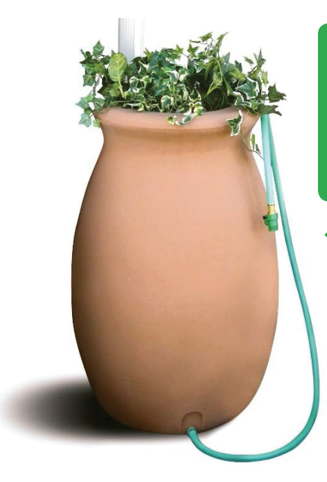
Manufacturer: Algreen Model: Castilla Volume: 50 gallons Dimensions: 33" x 23.5" x 23.5" Web: www.algreenproducts.com *Diverter kit required

Manufacturer: Rainwater HOG Model: Rainwater HOG Volume: 51 gallons Dimensions: 71" x 20" x 9.5" Web: www.rainwaterhog.com