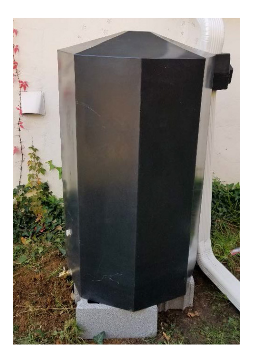
Manufacturer: RainGrid Model: RiverSides Volume: 132 gallons Dimensions: 51" x 27" Web: www.raingrid.com

The following barrels are eligible for the rain barrel rebate. We are not endorsing these barrels and your options are not limited to these examples, but the barrel you select does need to meet all required criteria outlined on page 2.