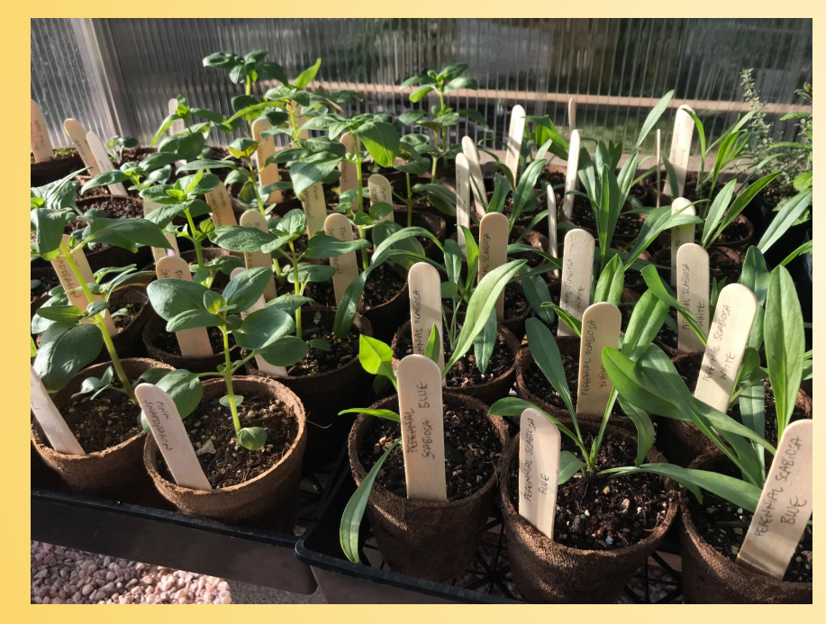
cristina flores flowers x flores