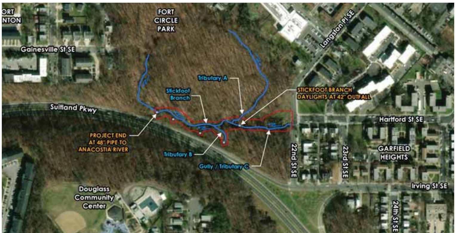
Figure 1. Stickfoot Branch stream restoration study area in red