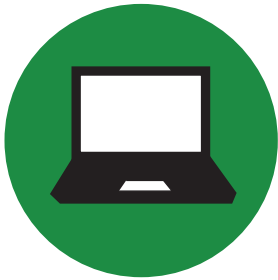
DESKTOP COMPUTERS AND LAPTOPS

The following electronics are banned from the trash: