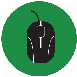
COMPUTER MICE AND KEYBOARDS