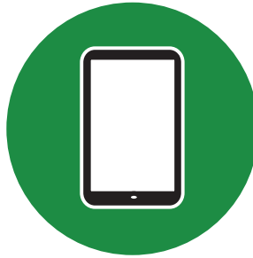
TABLETS AND e-READERS