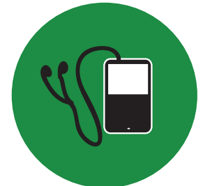
PORTABLE DIGITAL MUSIC PLAYERS

For more information about how to properly recycle electronics, visit doee.dc.gov/ecycle .