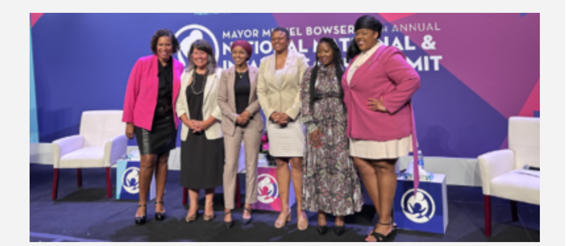
Plenary Session 4: Lunch and Learn with Tiffany Haddish

policies supporting paid time off for them. Perhaps the most striking revelation was the alarming statistic that Black women are four times more likely to die during childbirth, regardless of their education, income, or background. This panel emphasized the urgent need for policies that address these disparities and support parents with childcare and paid family leave.