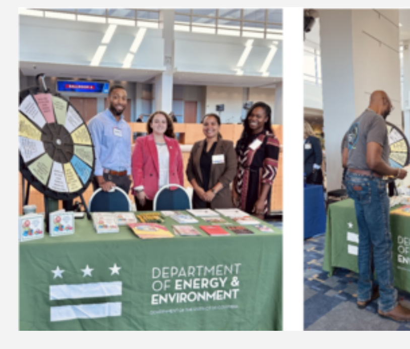
A Day of Empowerment and Community

One particularly engaging table was hosted by the brand Carol's Daughter, which not only offered attendees full-sized samples of their popular hair and skincare products but also provided the opportunity for social media-worthy pictures. The event underscored the abundance of resources available to mothers and families in Washington, D.C.