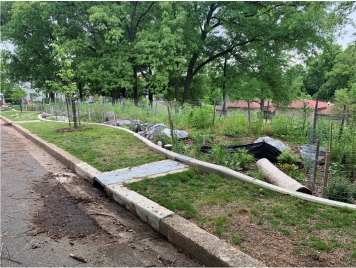
Newly installed bioretention along Hamlin Street NE at Langdon Park Recreation Center that treats stormwater from the roadway

EPA Region III recently issued the District's new Municipal Separate Storm Sewer System (MS4) permit, which authorizes discharges from the MS4 to receiving waters provided that the District complies with the permit's requirements. The new permit term runs from November 20, 2023 to December 20, 2028. All new permit-related documents can currently be found here .