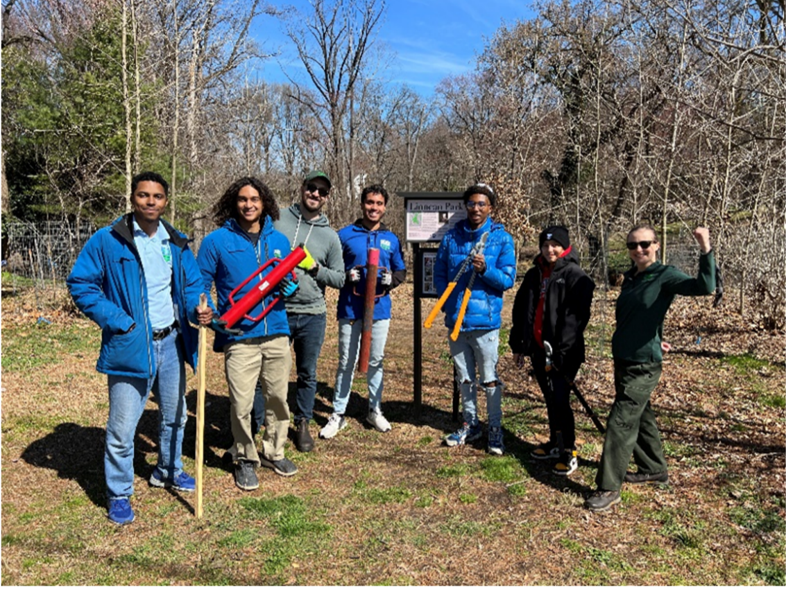
River Corps members and DOEE staff help to cage juvenile trees in the Linnean Stream Valley in early 2023

DOEE will host a pre-application meeting to discuss the RFA and answer questions on Tuesday, December 12, 2023 at 10:00 a.m. via WebEx. Please direct any questions, including requests for the pre-application meeting link, to 2024rivercorps.grants@dc.gov .