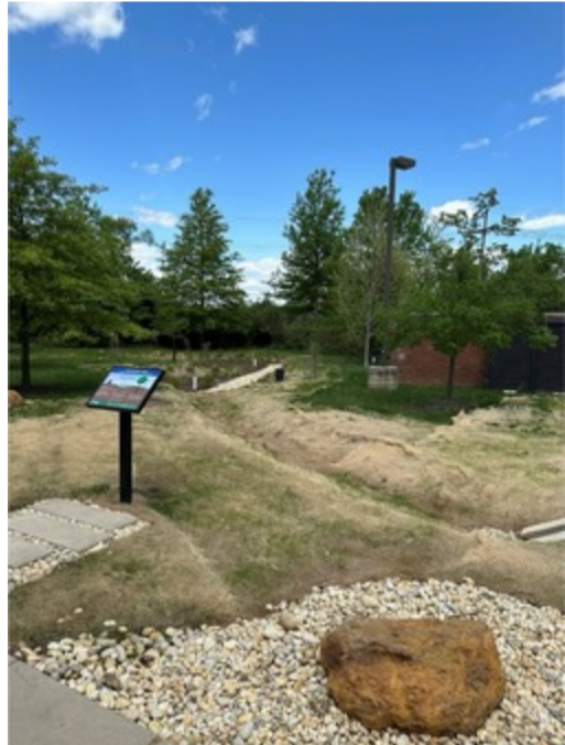
Image Description: A project at Anacostia High School retains and filters stormwater runoff, creates wildlife habitat with native plants, and provides an outdoor classroom for the students

Please contact P. Trinh Doan at patricia.doan@dc.gov with questions.